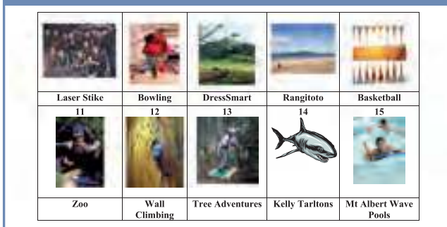
Afternoon Activities Sample Timetable